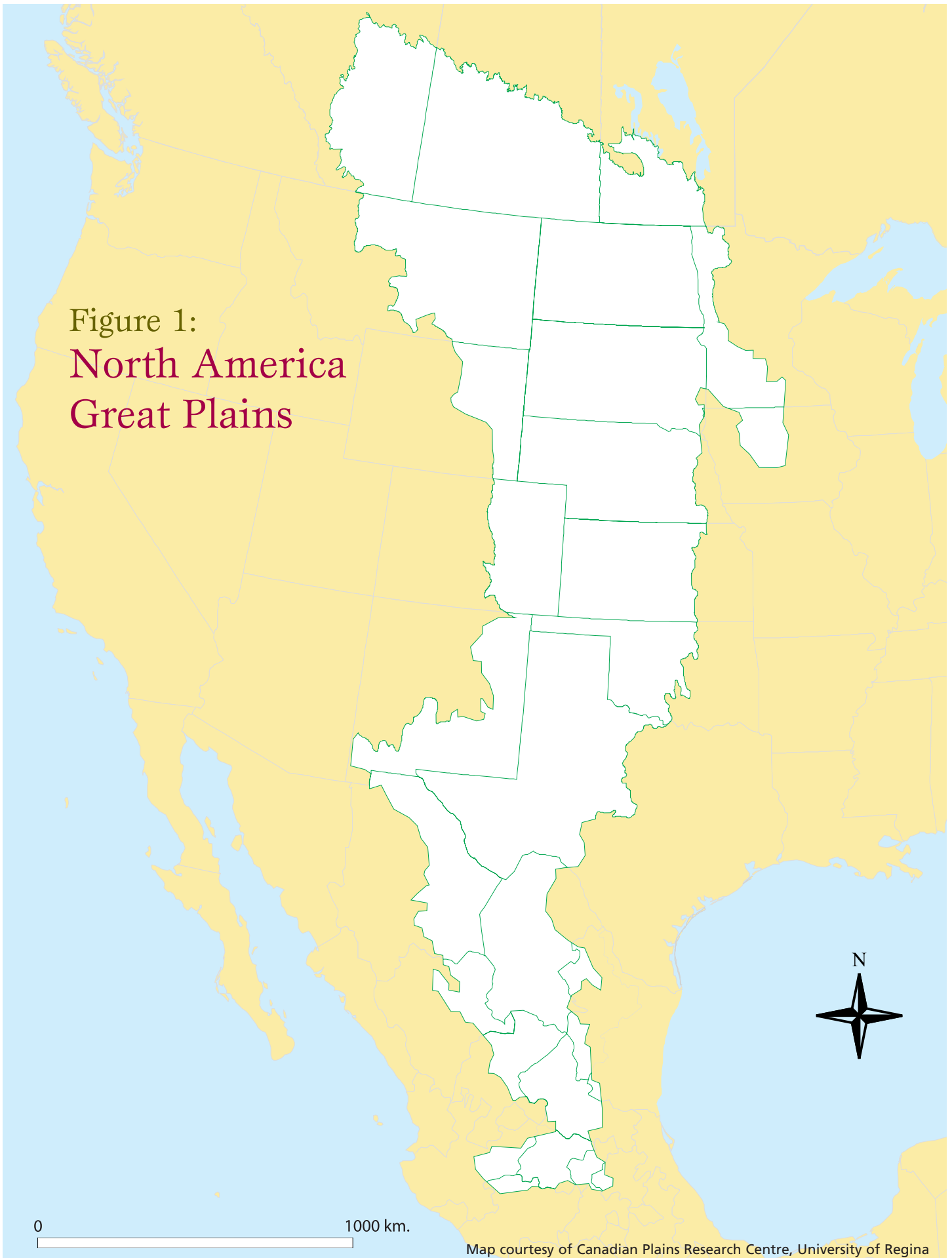
Figure 1: North America Great Plains